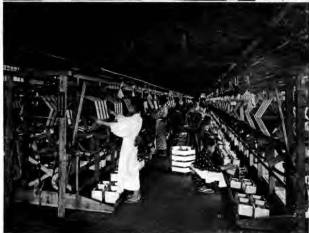
AT WORK IN A SILK FACTORY